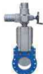
Knife Gate Valves: Size: 6mm to 300mm (1/4" to 12") • Body & End Piece: Cast Steel, Stainless Steel etc • Ratings: 150# to 600# equivalent in BS10, DIN etc • Seat Material: PTFE, Teflon, CFT, GFT, Metal Seated etc.