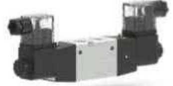
Solenoid Valves - • 2 Way • 3 Way • 5 Way • Namur Valves