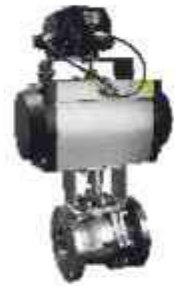
Ball Valves : Sizes- 1/4 " to 20" • Body Material- WCB/CF8/CF8M/MS • Pressure Range - Upto 20 Bar • Seal Material- PTFE, Teflon, CFT, GFT, Metal Seated etc